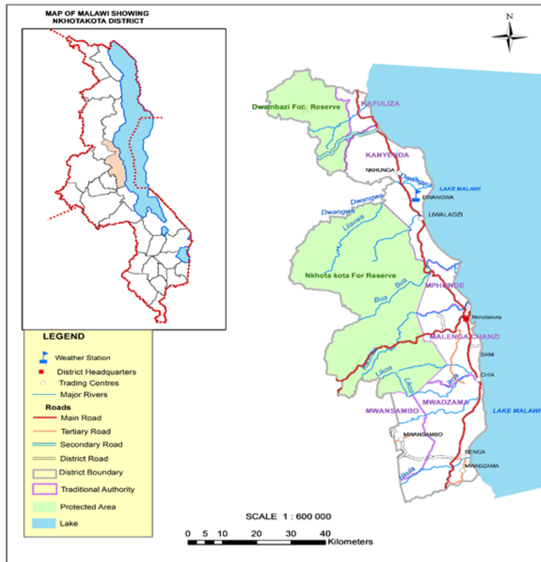
Figure 2. Map of Malawi showing Nkhosakota district and the study area [3].

local communities. Therefore, there is a need to investigate other sustainable livelihood sources that could be appropriate for such communities. Of course, there have been climate related studies on agriculture [64,65] and fisheries [3] in Nkhosakota, but these studies lacked aspects of interaction with other livelihood sources. For instance, Russell et al. [6] reported that Nkhosakota had fish farming activities, therefore it will be important to look at its interaction with agriculture while devising ways of scaling it up as a livelihood source.